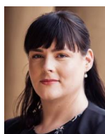
Kate Moss Director